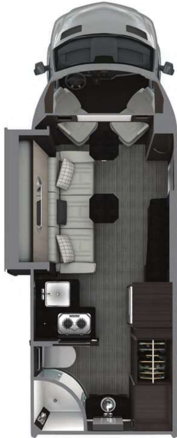
Atlas Lounge Slide-Out