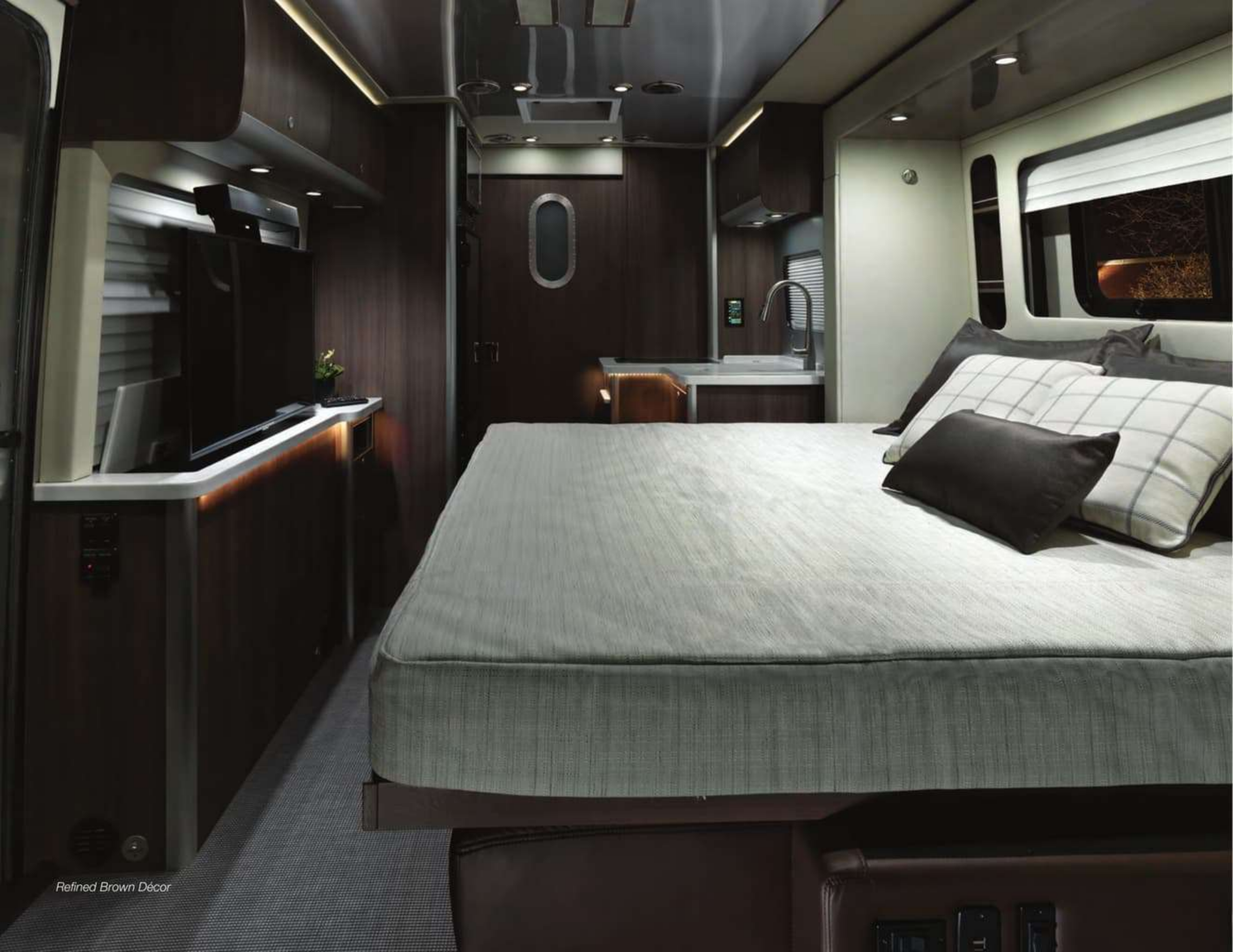
Refined Brown Décor