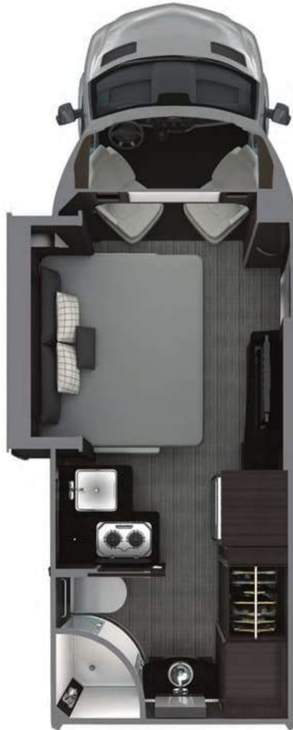
Atlas Sleeping Quarters