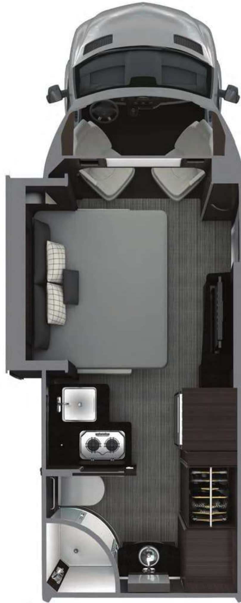
Atlas Sleeping Quarters