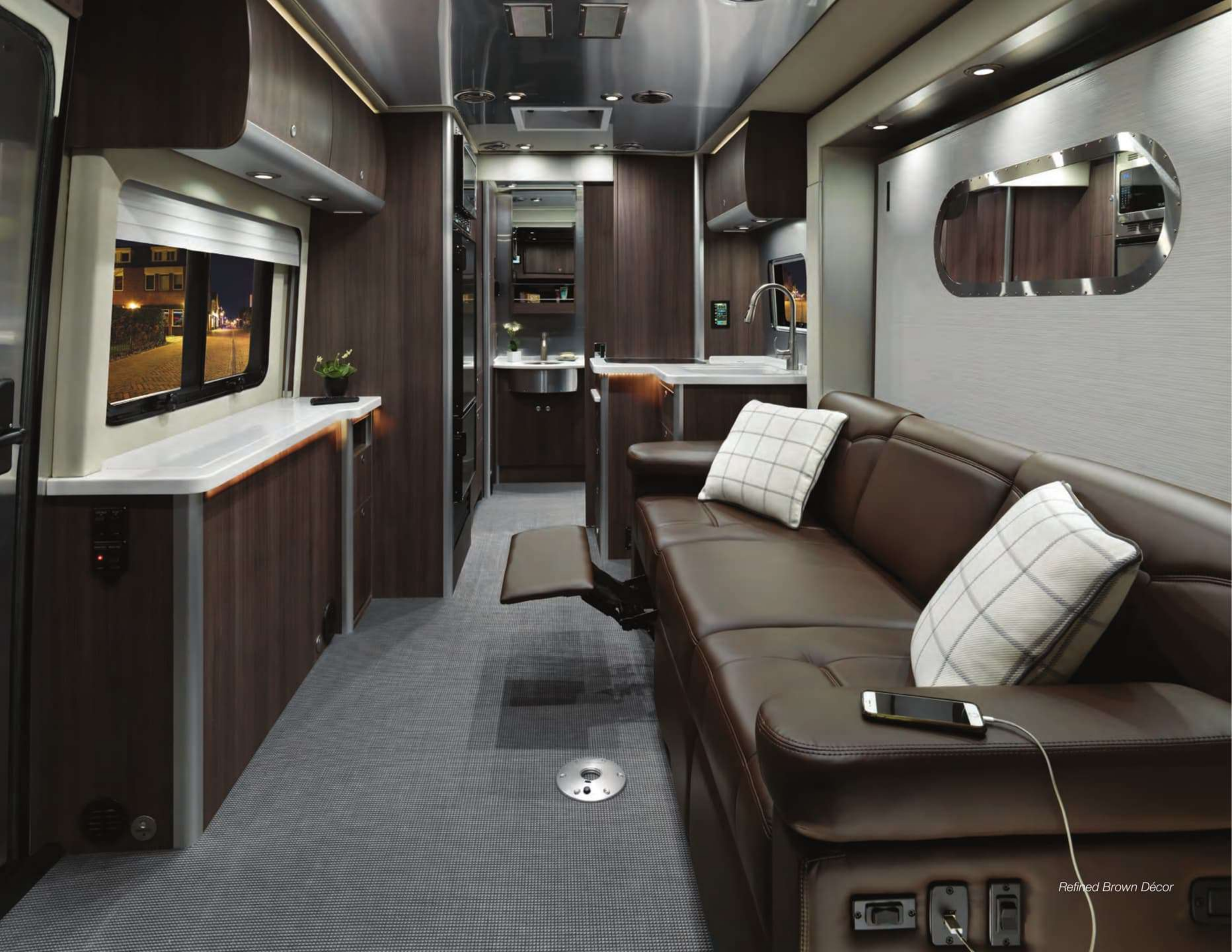
Refined Brown Décor