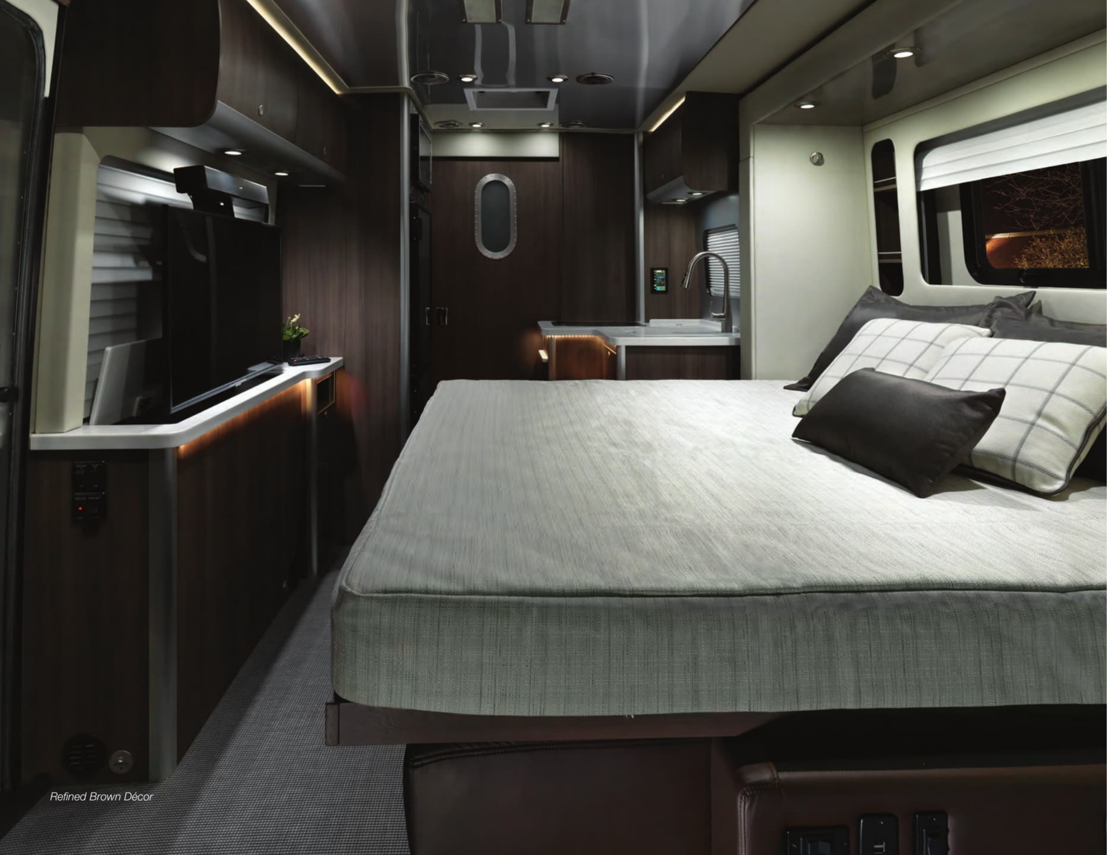
Refined Brown Décor